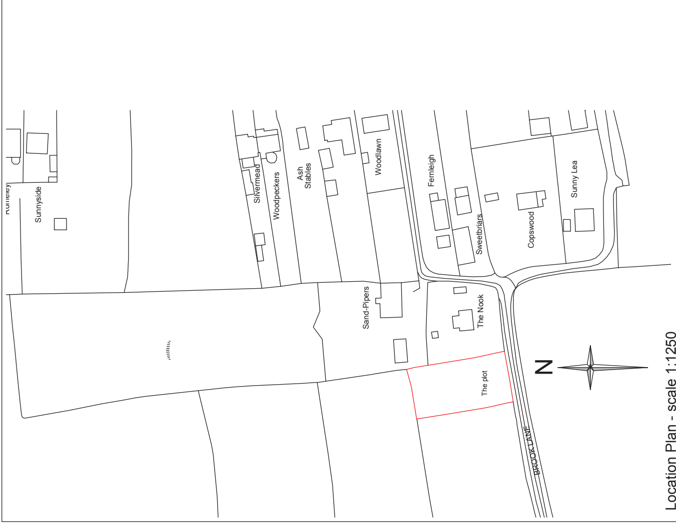
Location Plan - scale 1:1250

All figured dimensions to be checked on site before commencing work. No dimensions are to be scaled from this drawing. This drawing is to be used for Planning Permission only. A3 drawing